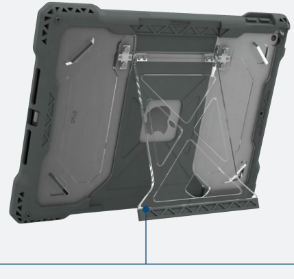
Smooth friction-hinge kickstand delivers unlimited positioning

AP-SXX2-IP9-BLK SHIELD EXTREMEX2 FOR IPAD 9 10.2"